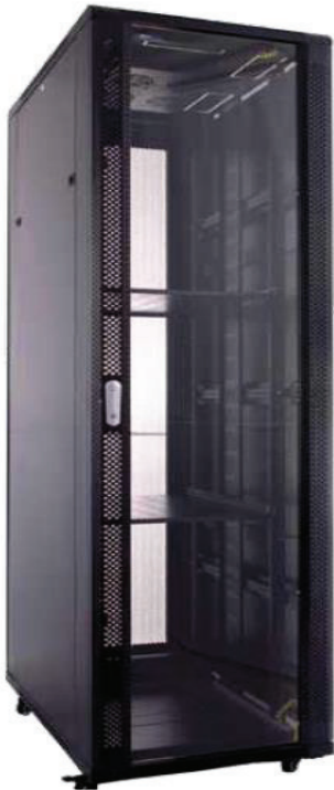
Reference image only